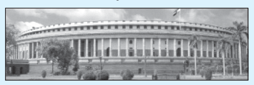
Arun Jaitley in Parliament

Fight against terror is a battle India cannot afford to lose